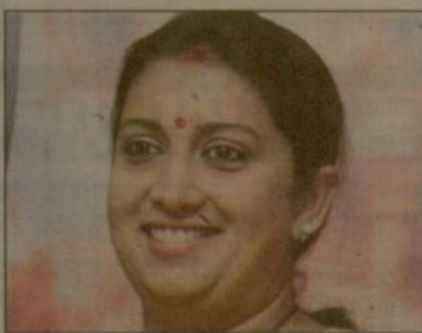
■ Smriti Irani

It is learnt that the committee had recommended a hike in the average annual fees from the present ₹90,000 to around ₹3 lakh. The committee had submitted its report to the ministry and sources say that HRD minister Smriti Irani is not in favour of taking an unpopular decision like fee hike at this juncture. However, the ministry is keen to provide greater finan-